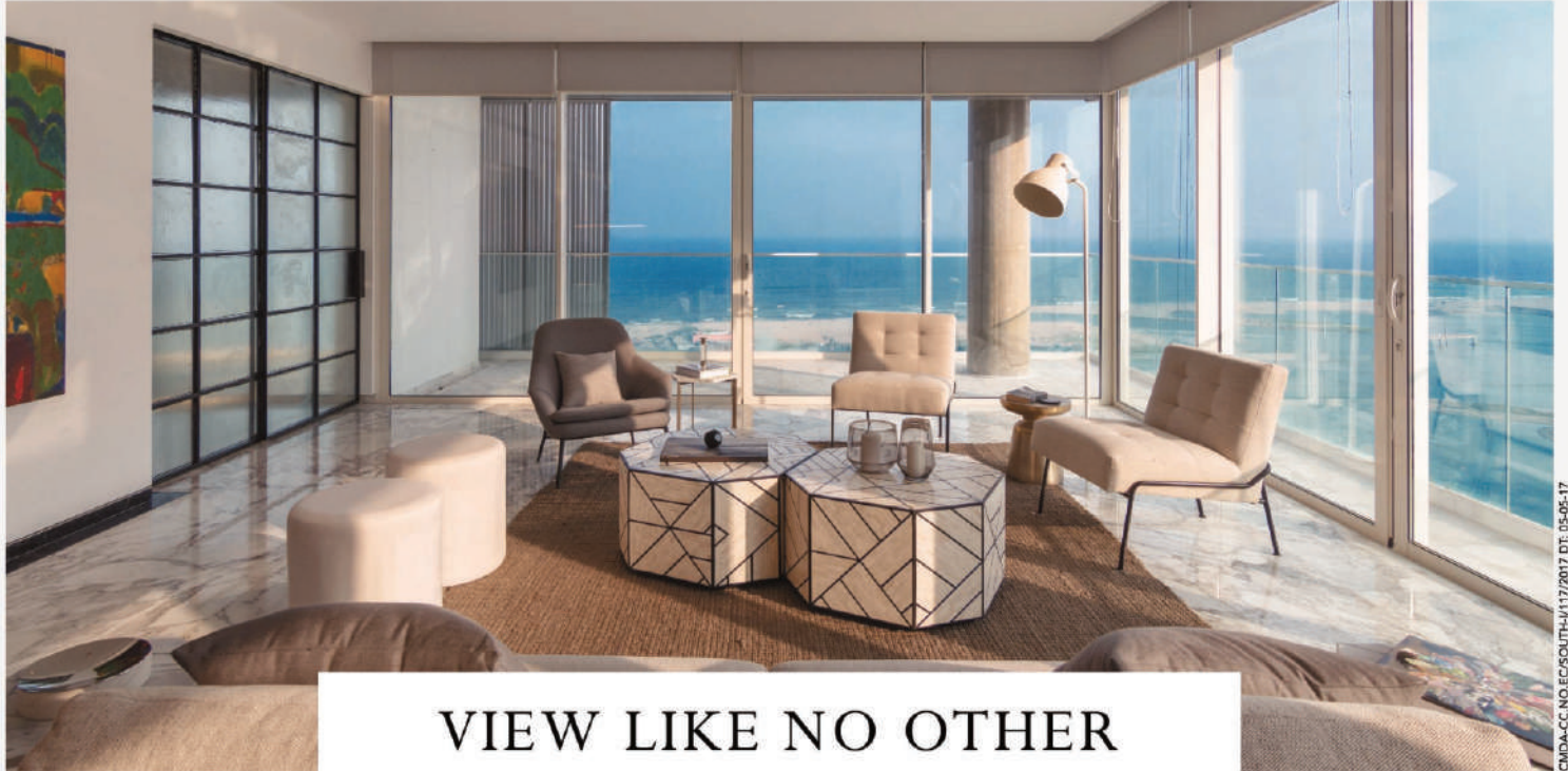
Image shot on location

CMAA-CC NO/EC/SOUTH-1/17/2017 DT: 05-05-17