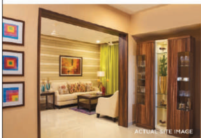
ACTUAL SITE IMAGE

LIFE MADE EASY Supermarket, ATM, Pharmacy, Laundry, Salon, Cafe and Restaurant are present, in the Retail Centre adjacent to the apartment.