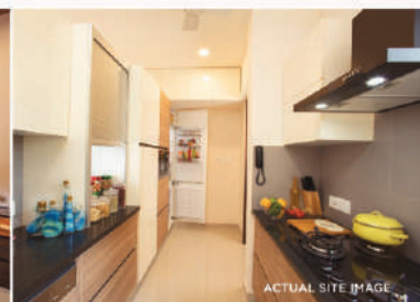
ACTUAL SITE IMAGE