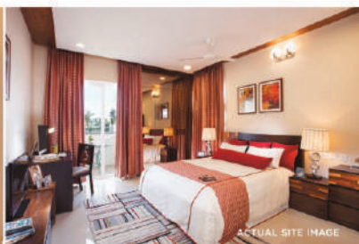
ACTUAL SITE IMAGE