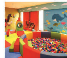
CHILDREN'S PLAY AREA - Indoor