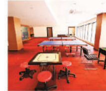
INDOOR GAMES AREA