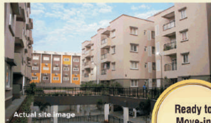
Actual site image

RERA No. IRIS: TNHRA/0298/2018 | VIOLET: TNHRA/016/2019 | INDIGO: TNHRA/051/2019