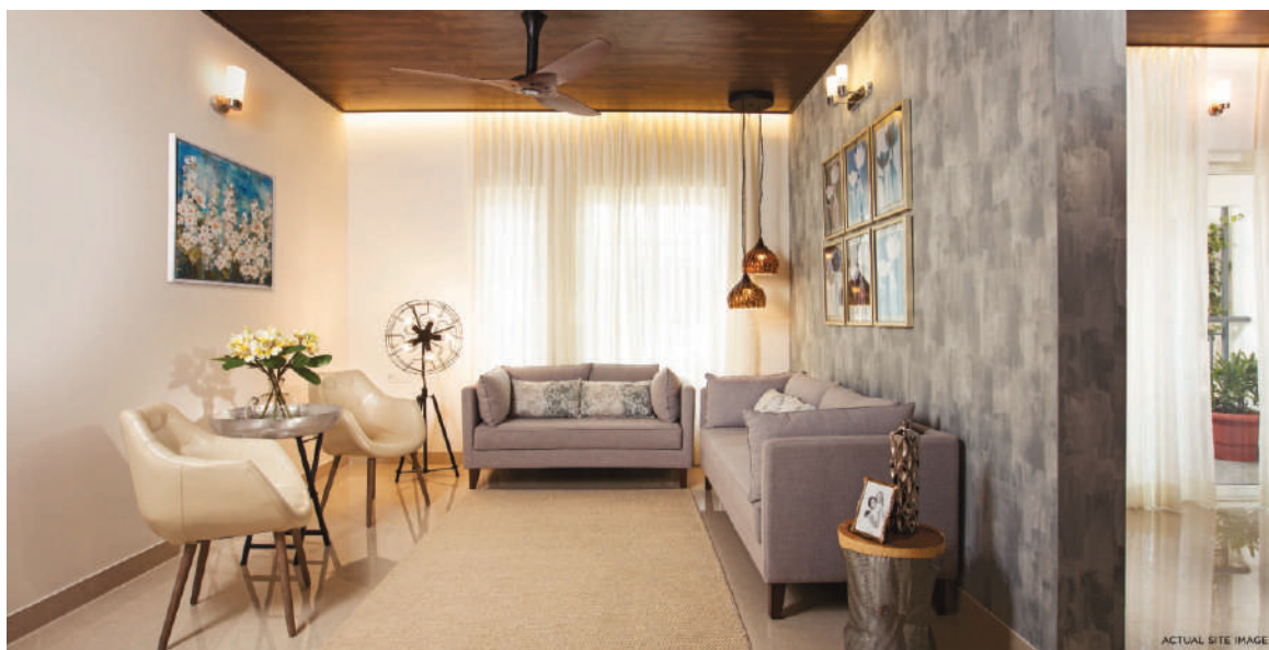
ACTUAL SITE IMAGE