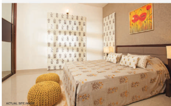
ACTUAL SITE IMAGE