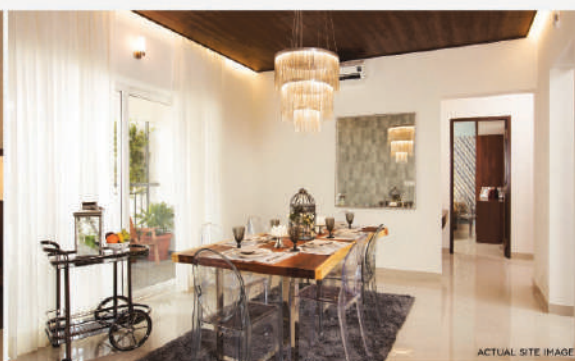
ACTUAL SITE IMAGE