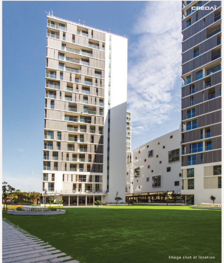
Image shot at location

one74.com | enquiry@ceebros.com | 174, Adyar Seaface, MRC Nagar, Chennai, 600 028, India