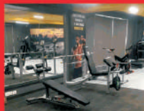
ACTUAL PHOTOS TAKEN AT SITE