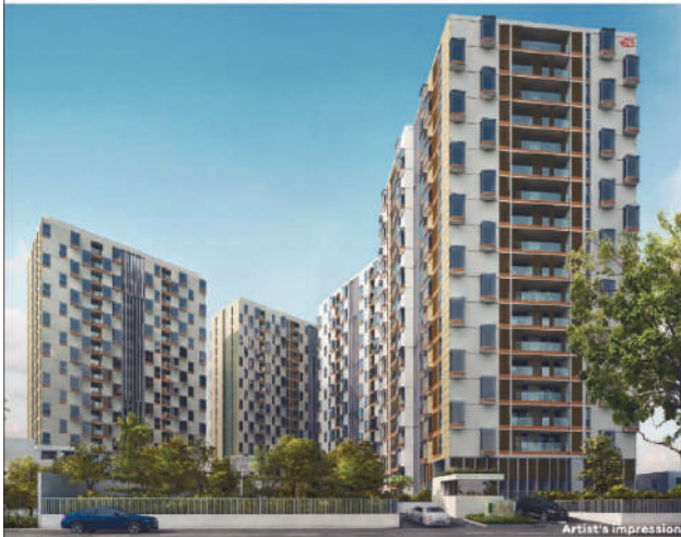
River View Road, Kotturpuram, overlooking the Boat Club Area.