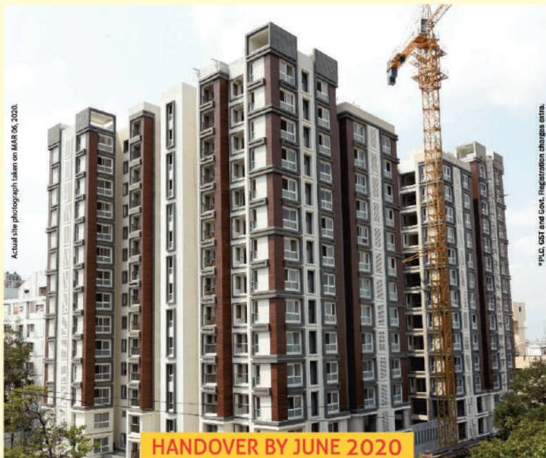
Actual site photograph taken on MAR 06, 2020.